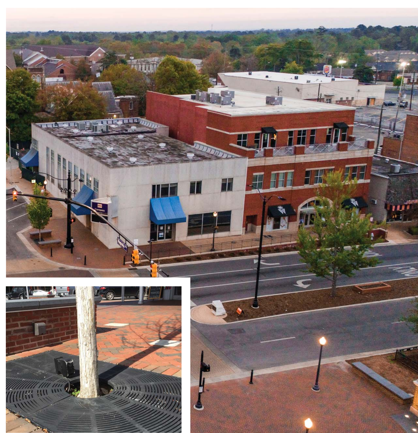
Silvacell installation, Toomer's Intersection, Auburn, AL