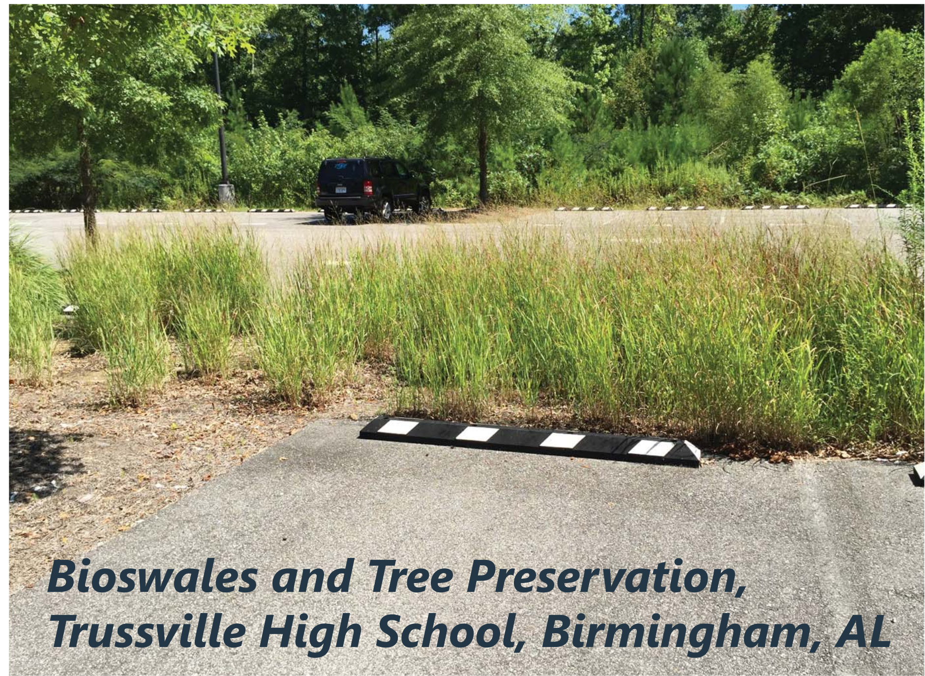
Bioswales and Tree Preservation, Trussville High School, Birmingham, AL