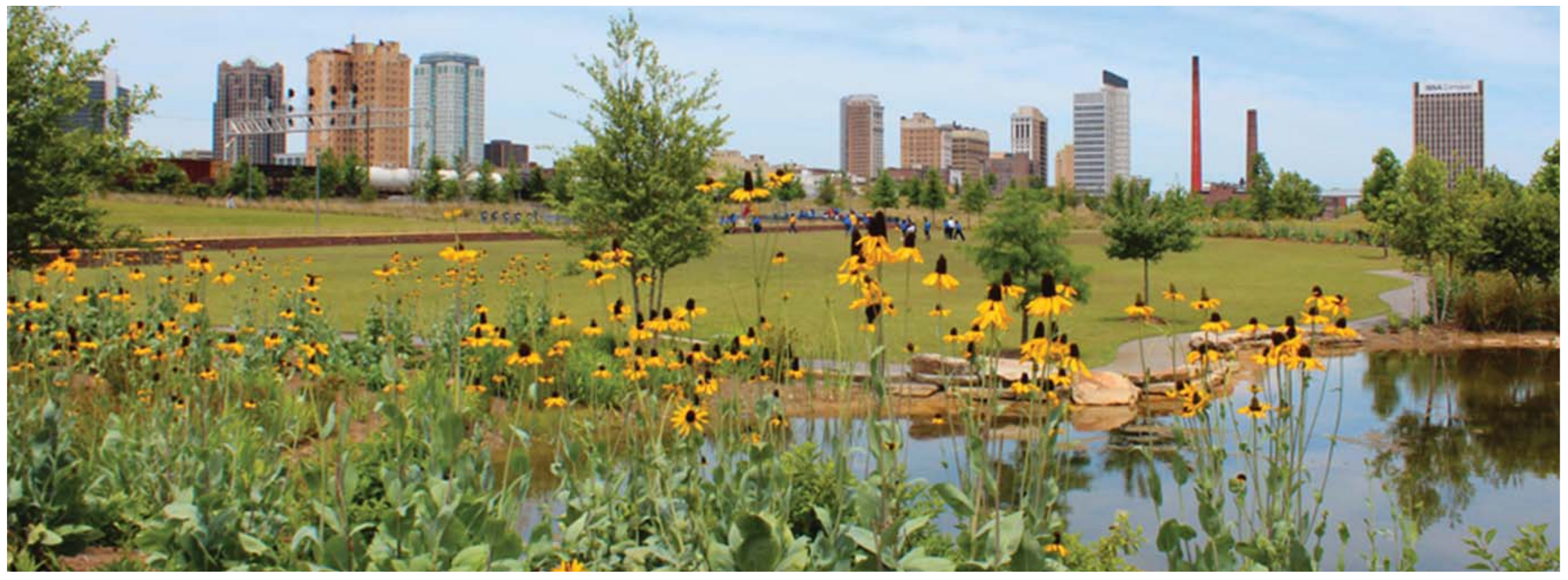
Railroad Park, Birmingham, AL