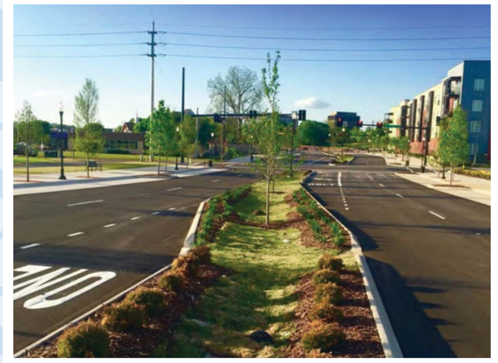
Median Bioretention/Swale, Lowery Blvd., Huntsville, AL