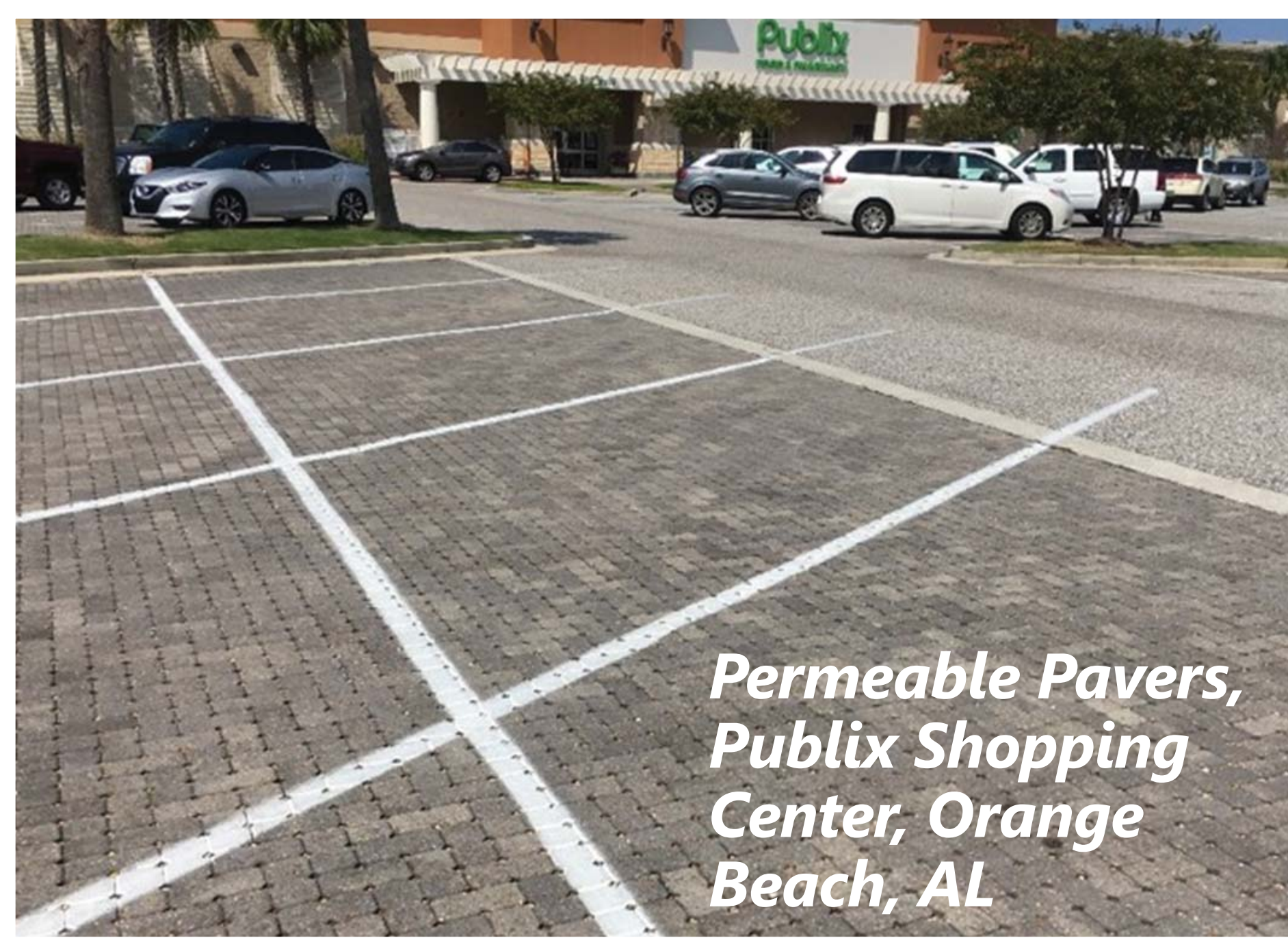
Permeable Pavers, Publix Shopping Center, Orange Beach, AL